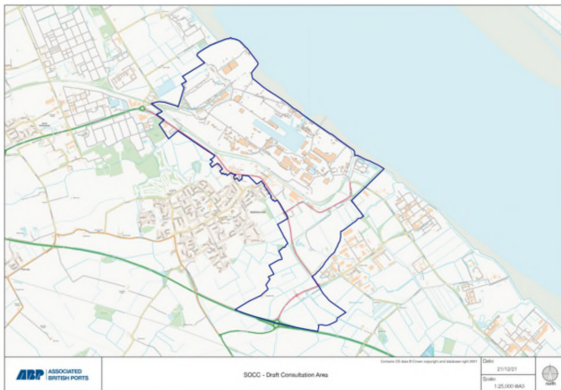
Figure 3: Map showing mail-out area

2.61 Figure 1 – Extract from SoCC - Figure 3: Map showing mail-out area